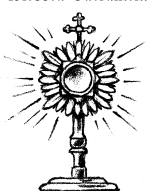
Adoration of the Blessed Sacrament

EUCCHARISTIC ADORATION First Saturday October 5 from 9:00 a.m.-12 noon. Please feel free to stop by for silent prayer and adoration at any time that is convenient.